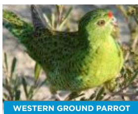
WESTERN GROUND PARROT