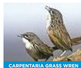
CARPENTARIA GRASS WREN